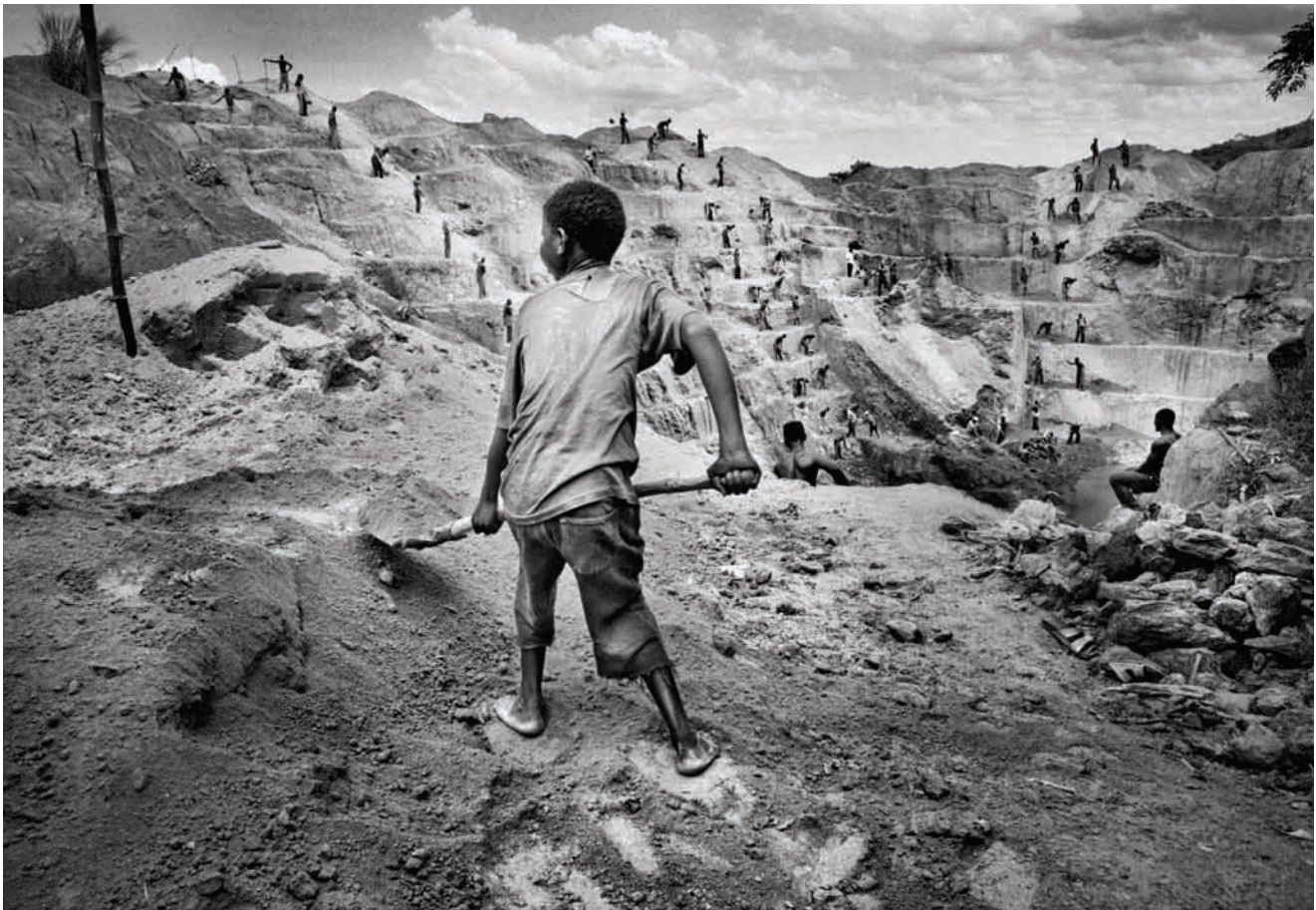
A child mines for gold in Watsa, Ituri province, Democratic Republic of Congo, October 2004.

Auditors like Ernst & Young play a major public interest role in providing assurance that companies are meeting important standards. If auditors cannot be relied upon to meet the highest ethical principles, then progress in breaking the links between natural resources and conflict could be undermined.