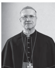
Cardinal Tarcisio Bertone S.D.B., Secretary of State (President of the Commission)

Cardinals' Commission , appointed by Papal Decree for a period of five years.