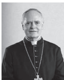
Cardinal Odilo Pedro Scherer Archbishop of Sao Paulo (Brazil)