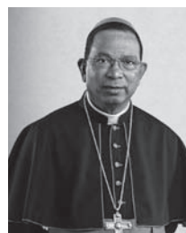
Cardinal Telesphore Placidus Toppo Archbishop of Ranchi (India)