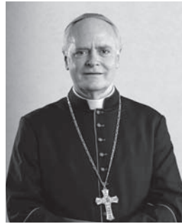
Cardinal Odilo Pedro Scherer