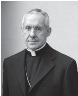
Cardinal Jean-Louis Tauran