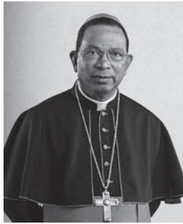
Cardinal Telesphore Placidus Toppo