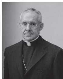
Cardinal Jean-Louis Tauran President of the Pontifical Council for Interreligious Dialogue